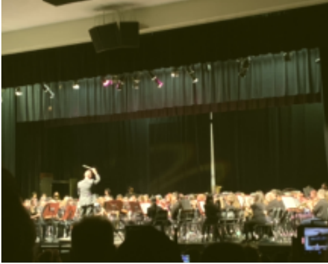
The students performing during the band concert at Western High School on May 24th.