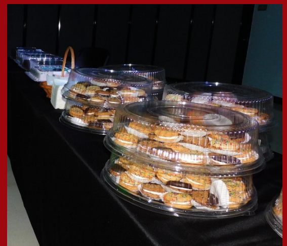
Cookies and cream sandwiches and other desserts given at the 8th grade dance.

There was lots of food, desserts and drinks provided at the dance. For the main meals, there were sliders, chicken nuggets from Chick-fil-A, mini hot dogs, mozzarella sticks, and spring rolls. The sauces that were included came from Chick-fil-A. Drinks included water, lemonade, and Hawaiian Punch. There was a snack stand that offered twizzlers and popcorn. There were two chocolate cakes and two vanilla cakes, along with a lot of cookies and cream sandwiches. There was also a cotton candy stand where students could watch their cotton candy get made.