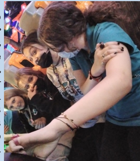
Many students had a blast on the rollercoaster ride.