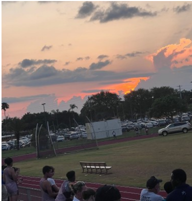
Spectators watch as the regionals for track begins and runners start their warm ups.