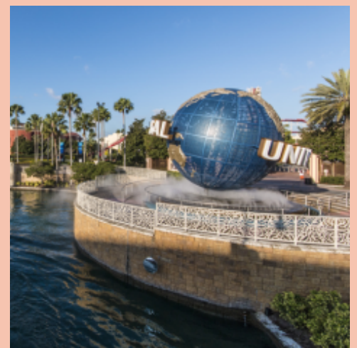
Many 8th graders enjoyed themselves at Universal.