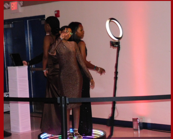
Three friends are using the 360 ring-light camera to take a cool video of themselves.