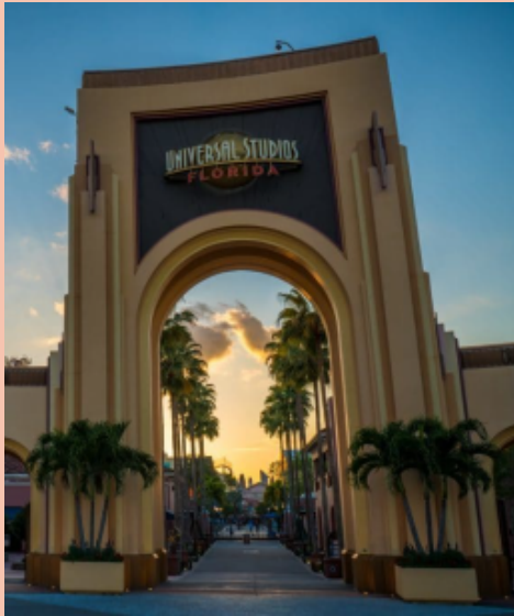
The Universal gates come as a sign of joy to many.