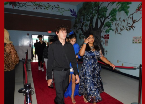
Friends walking down the red carpet as they enter.