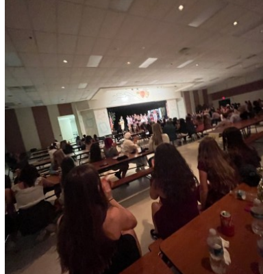
A 360 view of the banquet while athletics were receiving rewards.