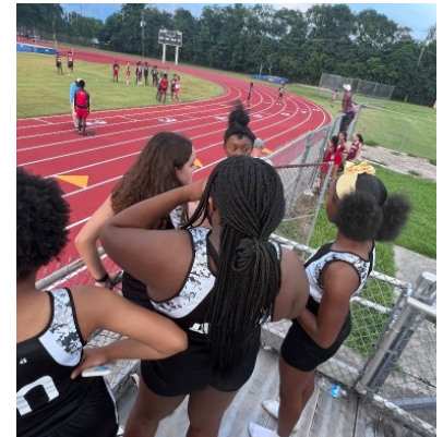
The track team anticipates the score of their fellow team and get ready to run 800 meters.

As the Indian Ridge Middle School track season begins, track players are ready to head to regionals with several practices and meets. Thirty-seven track players practice every week to better their times and get ready for tournaments.